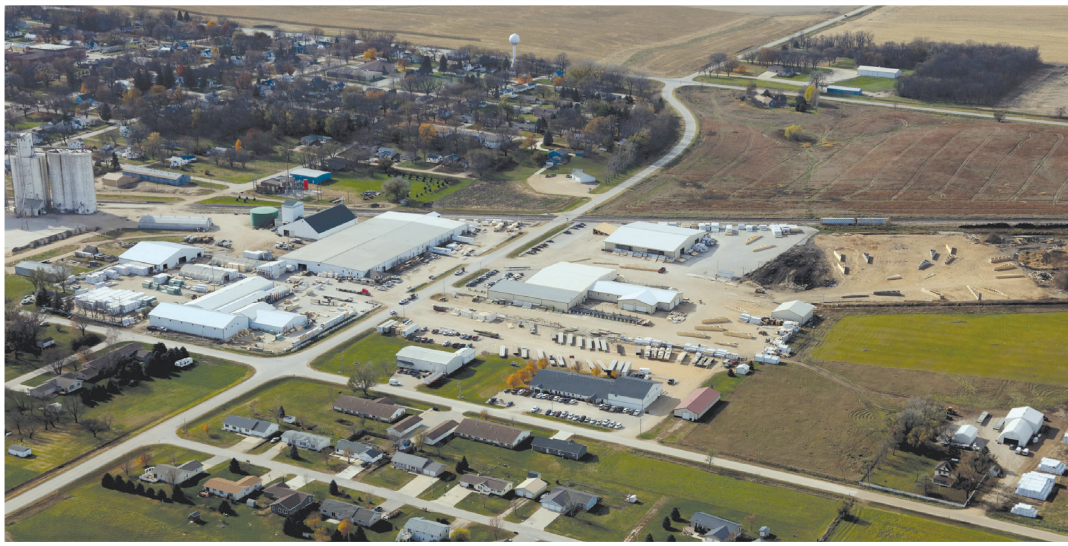
EPS: Graettinger, Iowa Plant